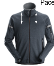
Placements 1 and 3